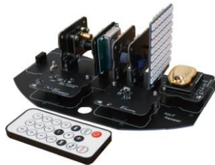
8 types of sensor modules