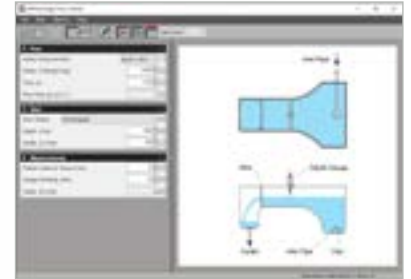
SCREENSHOT OF THE HDMS SOFTWARE