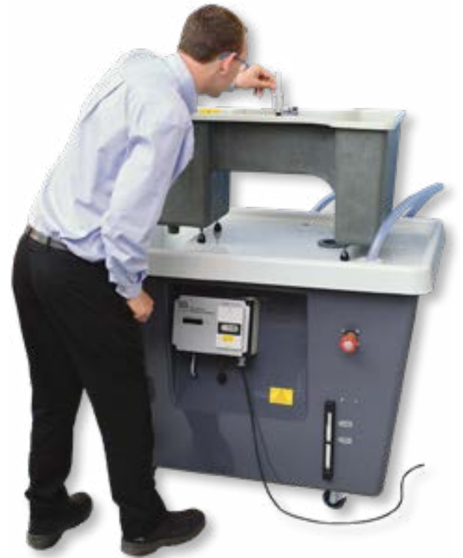
SHOWN WITH THE DIGITAL HYDRAULIC BENCH (HIF, AVAILABLE SEPARATELY)

80% at temperatures < 31°C decreasing linearly to 50% at 40°C