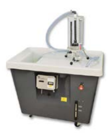
SHOWN WITH TECQUIPMENT'S DIGITAL HYDRAULIC BENCH (HIF) - AVAILABLE SEPARATELY