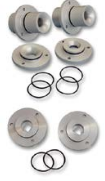
SET OF ORIFICES

If required students can download TecQuipment's Hydraulics Data Management System (HDMS) software onto a suitable computer (not supplied) to aid with entering, evaluating and presenting their data.