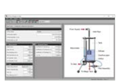
SCREENSHOT OF THE HDMS SOFTWARE

A cylindrical tank with an adjustable diffuser that demonstrates flow through different orifices for different flow rates.